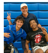
Mekai Curtis 449K followers