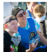
Jacob Bertrand 2.9M followers