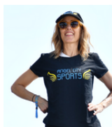
Kim Raver 1.7M followers