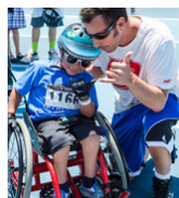
Adam Sandler 14.4M followers