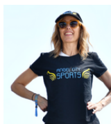
Kim Raver 1.8M followers