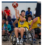
Austin Reaves 1.5M followers