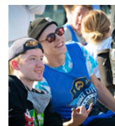
Jacob Bertrand 2.7M followers