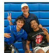
Mekai Curtis 667K followers