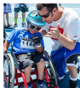
Adam Sandler 25M followers